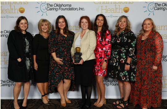
The Care Center team poses with the Dr. Rodney L. Huey Memorial Champion of Oklahoma Health trophy. The Care Center was named the overall award winner at the 2022 Champions of Health Gala.

The 19th annual Champions of Health gala was held on Tuesday, Sept. 27 at the Cox Business Center in Tulsa. Five deserving Oklahoma organizations were honored, and NFL sideline reporter, television personality, and actress, Erin Andrews, served as the keynote speaker. Andrews spoke about her cervical cancer diagnosis in 2016 and the importance of cancer screenings.